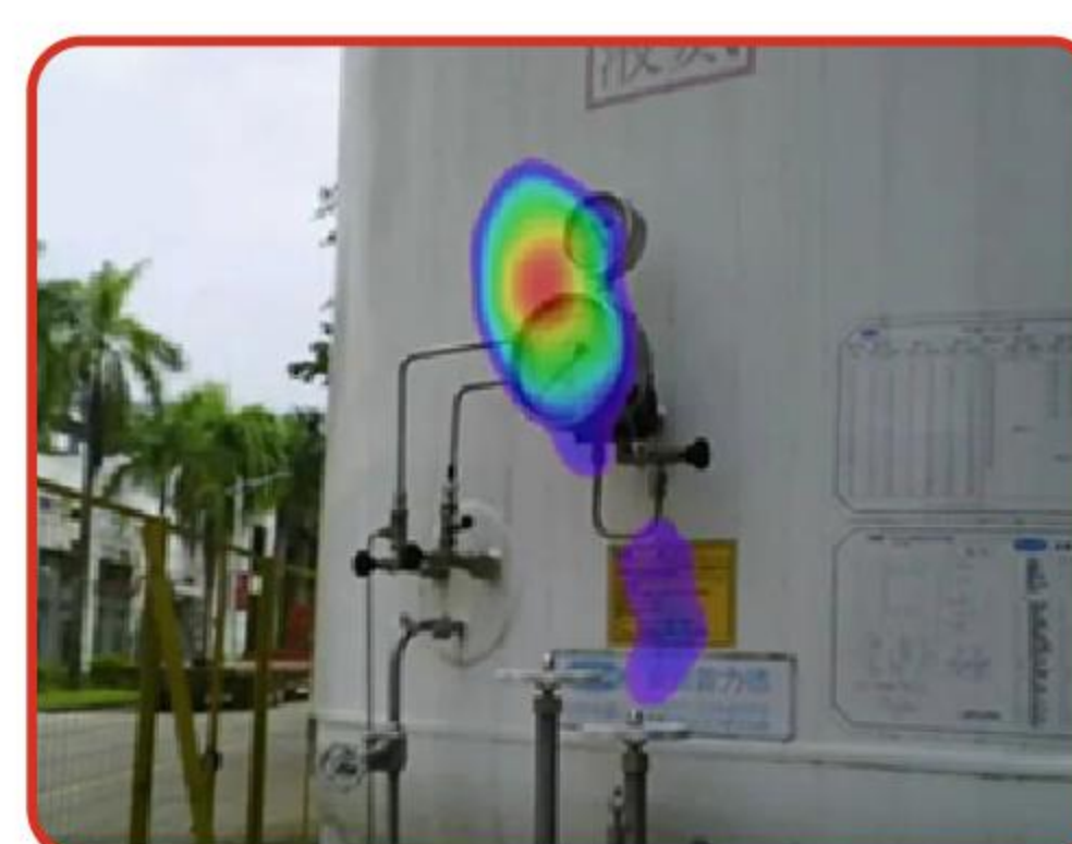
Valve piping leak detection