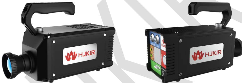
Figure 1 MC11H Medium Wave Refrigeration Infrared Thermal Imaging Thermometer Product Picture

MC11H high frame rate medium wave cooled infrared thermal imaging thermometer adopts excellent performance medium wave mercury cadmium telluride cooled infrared detector, which has the characteristics of high sensitivity, fast response speed and high frame rate, and can obtain the infrared thermal distribution of fast moving targets; the product can provide special spectral filters, such as flame temperature measurement filters, special gas spectral filters, etc.; rich data interfaces and professional data analysis software can be widely used in various scientific research fields.